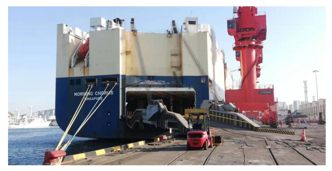
The lady arrives